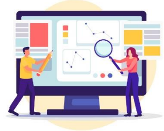
Employment administration and education administration