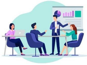
Working life actors